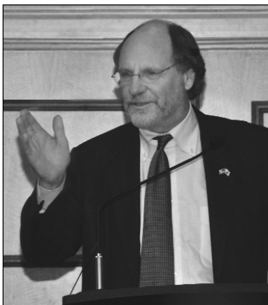
NJ Governor Jon Corzine.

On September 8th 2009, NJ Governor Corzine signed bill authorizing the formation of County Housing Trust Funds to be funded by a three dollar surcharge on any document recorded with the county. To set up the Fund, a County must have, or be in the process of creating, a ten year plan to end homelessness.