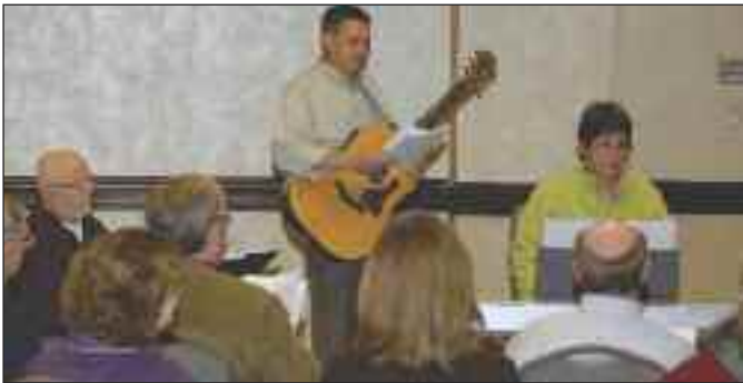
The Family Promise Choir rehearsing for the Sunday Interfaith Worship Service.